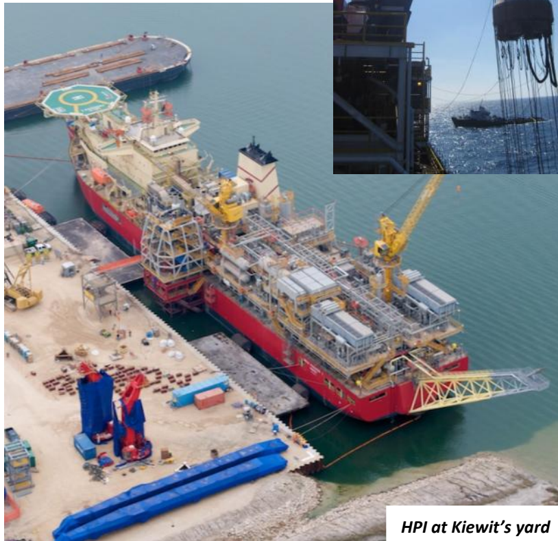
HPI at Kiewit's yard