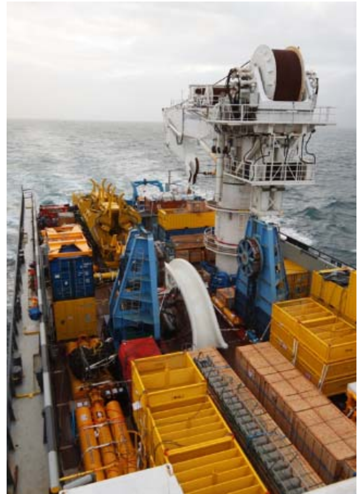
Olympic Triton underway to begin Anadarko Jubilee project in Ghana