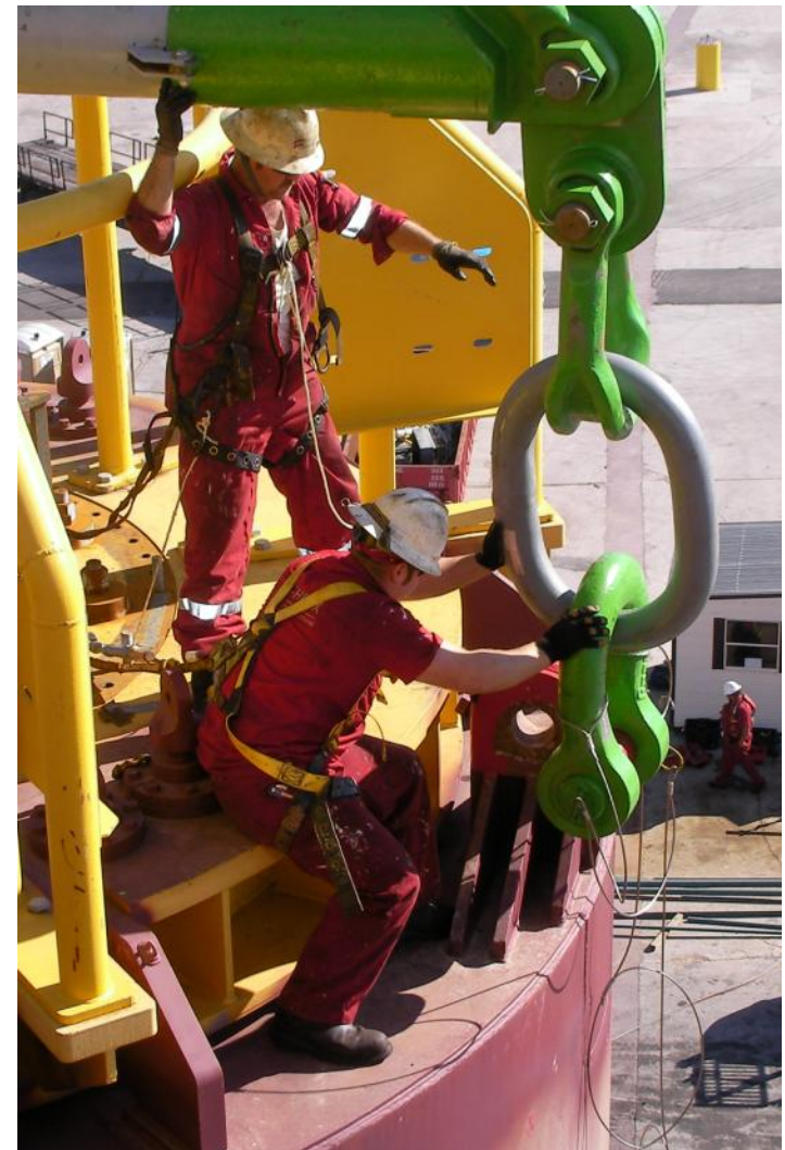
Phoenix Project DTS buoy loadout