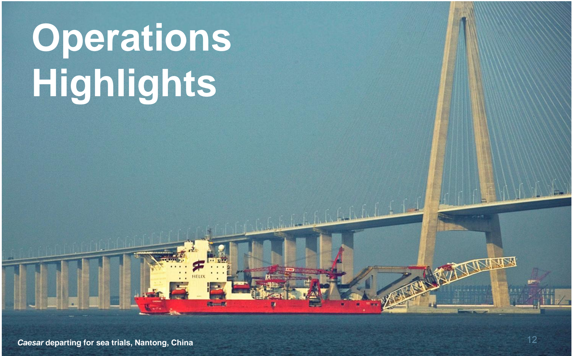
Caesar departing for sea trials, Nantong, China