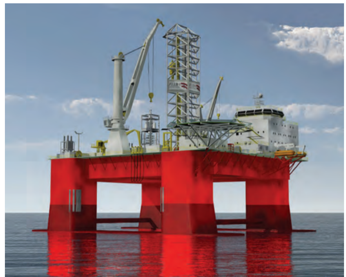
Q5000 MODU, due for 2015 delivery

We have now positioned Helix as a focused “go to” provider of critical subsea services in the growing deepwater oil and gas sector as well as the emerging renewable energy business.