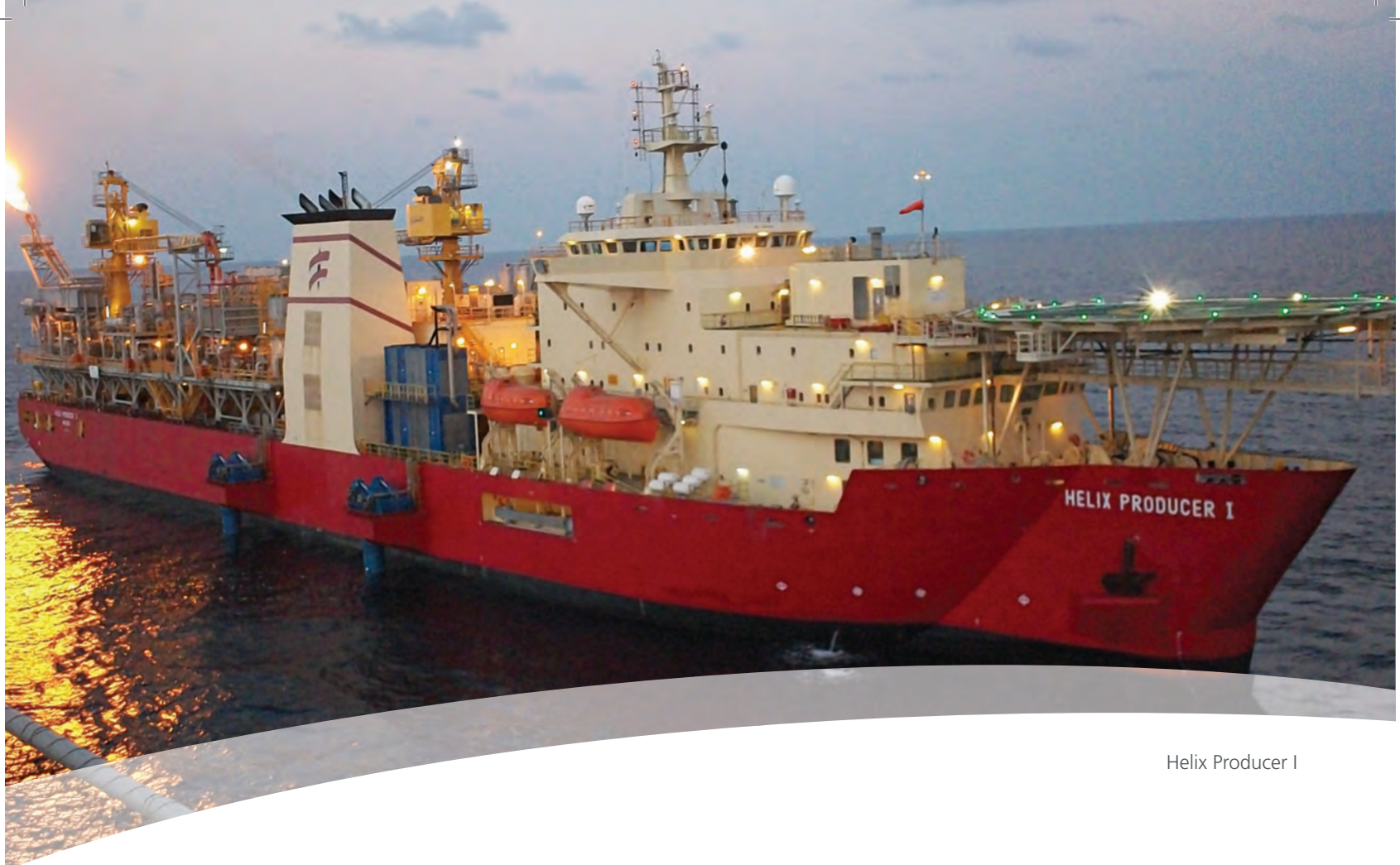
Helix Producer I

Our oil and gas operations continued to contribute significantly to the bottom line. We announced a significant oil discovery in the Phoenix field at the Wang prospect. In December, we announced the sale of our oil and gas operations for $620 million plus future considerations dependent on the production profile of the Wang well.