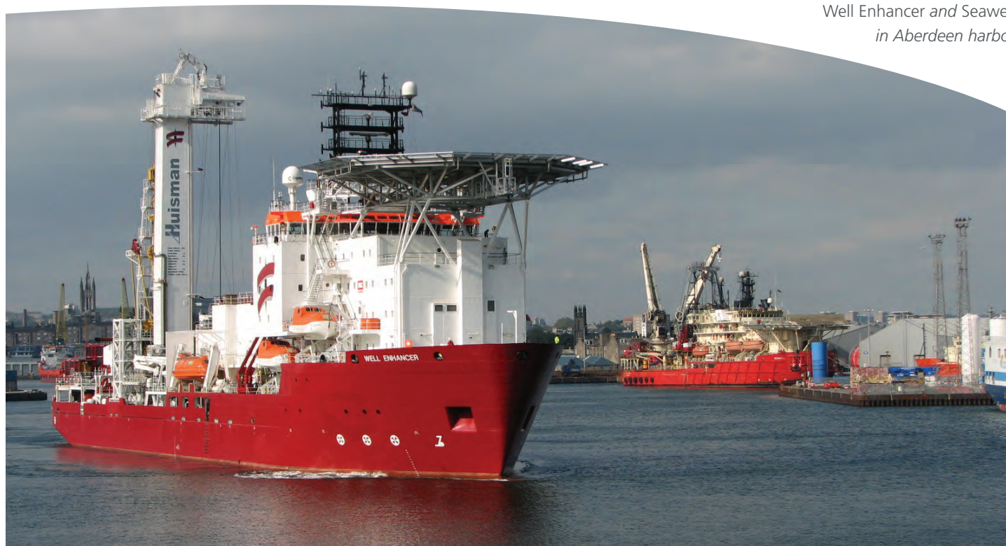
Well Enhancer and Seawell in Aberdeen harbor

Any statements included in this 2012 Annual Report that are not historical facts, including without limitation statements regarding our plans for growth, future market trends and results of operations are forward-looking statements within the meaning of applicable securities laws.